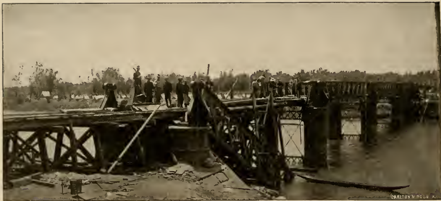
DISMANTLED BRIDGE OVER THE BAGBAG RIVER, WHICH THE KANSANS CROSSED UNDER FIRE.